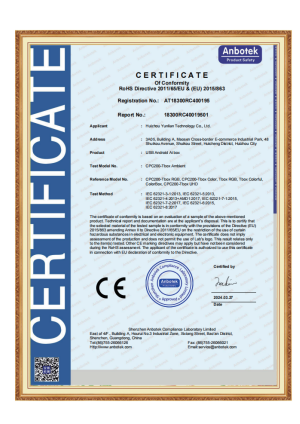
Rosh Certification Registration No.: AT18300RC400195