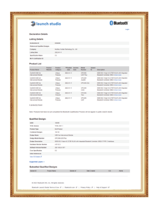
Bluetooth Membership QDID:189005