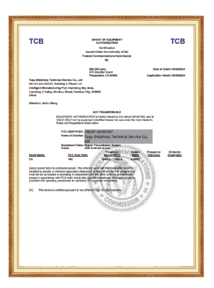
FCC Certification FCC ID: 2BKBF-AMBIENT